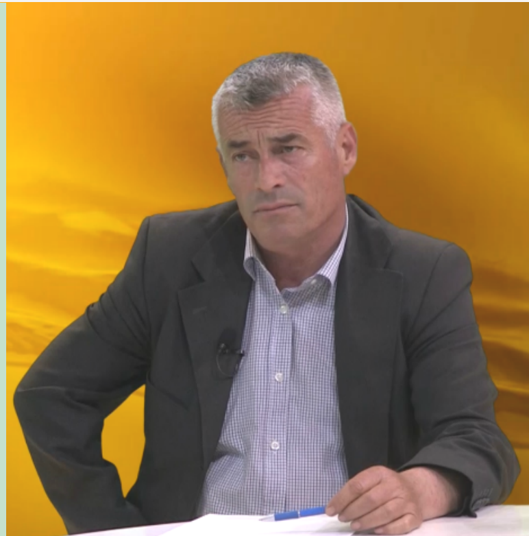
Kosovo national hero Murat Mehmeti