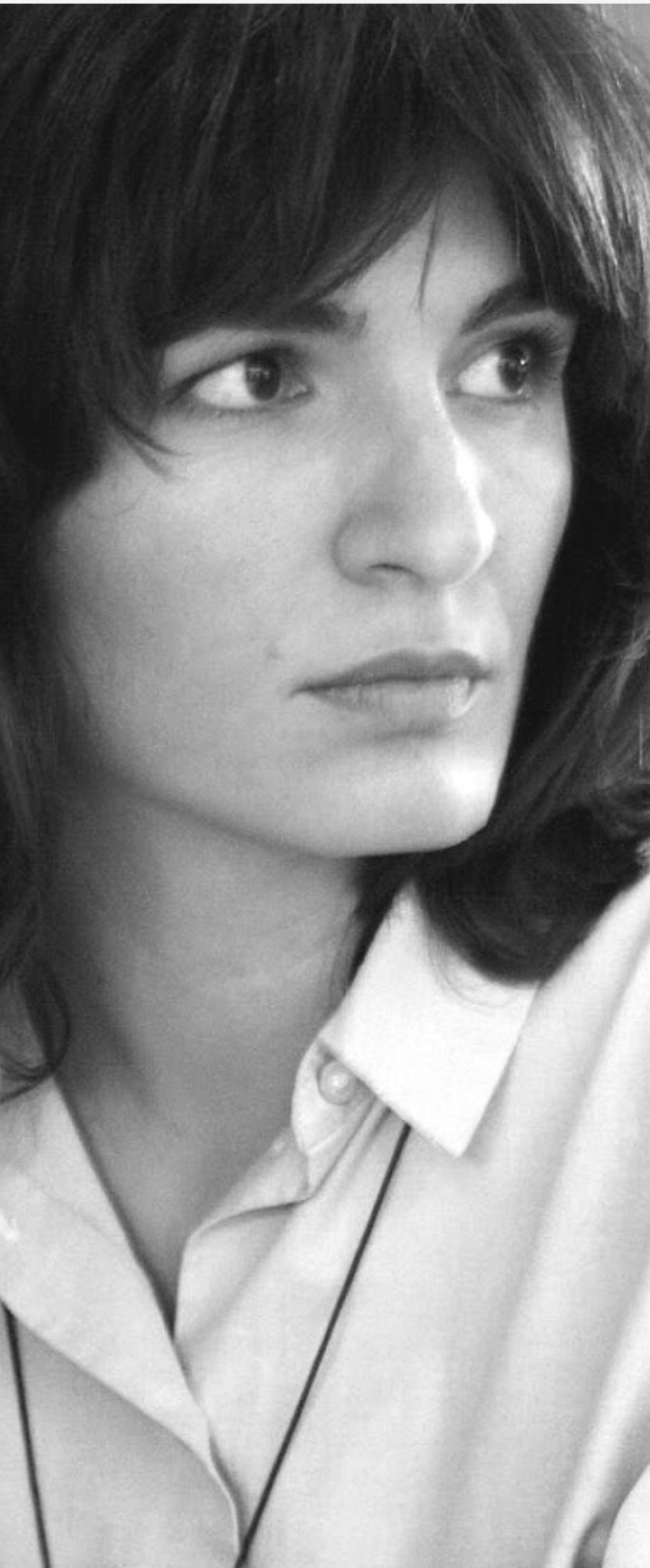
Bosnia and Herzegovina national hero Sabina Ćudić