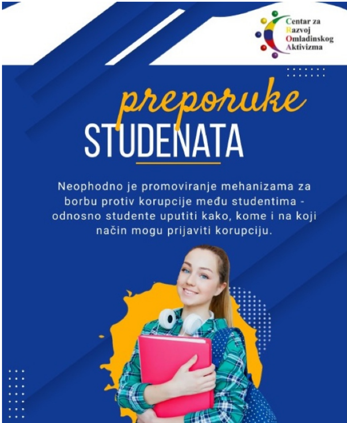
Infographic on combating corruption in education, produced by CROA

CROA's initiative underscores the importance of transparency and youth engagement in creating a corruption-free educational environment, encouraging proactive steps towards a more accountable society.