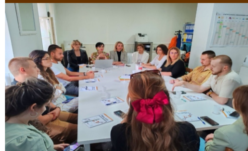
Picture taken at CROA's coffee session with youth